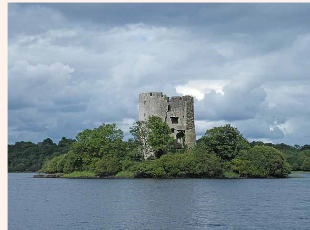
Picture: Clough Oughter Castle, County Cavan

OBJECTIVE 4.3: Provide an active role in educating key partners and stakeholders in the role of PPNs in providing Participative Democracy and what that is.