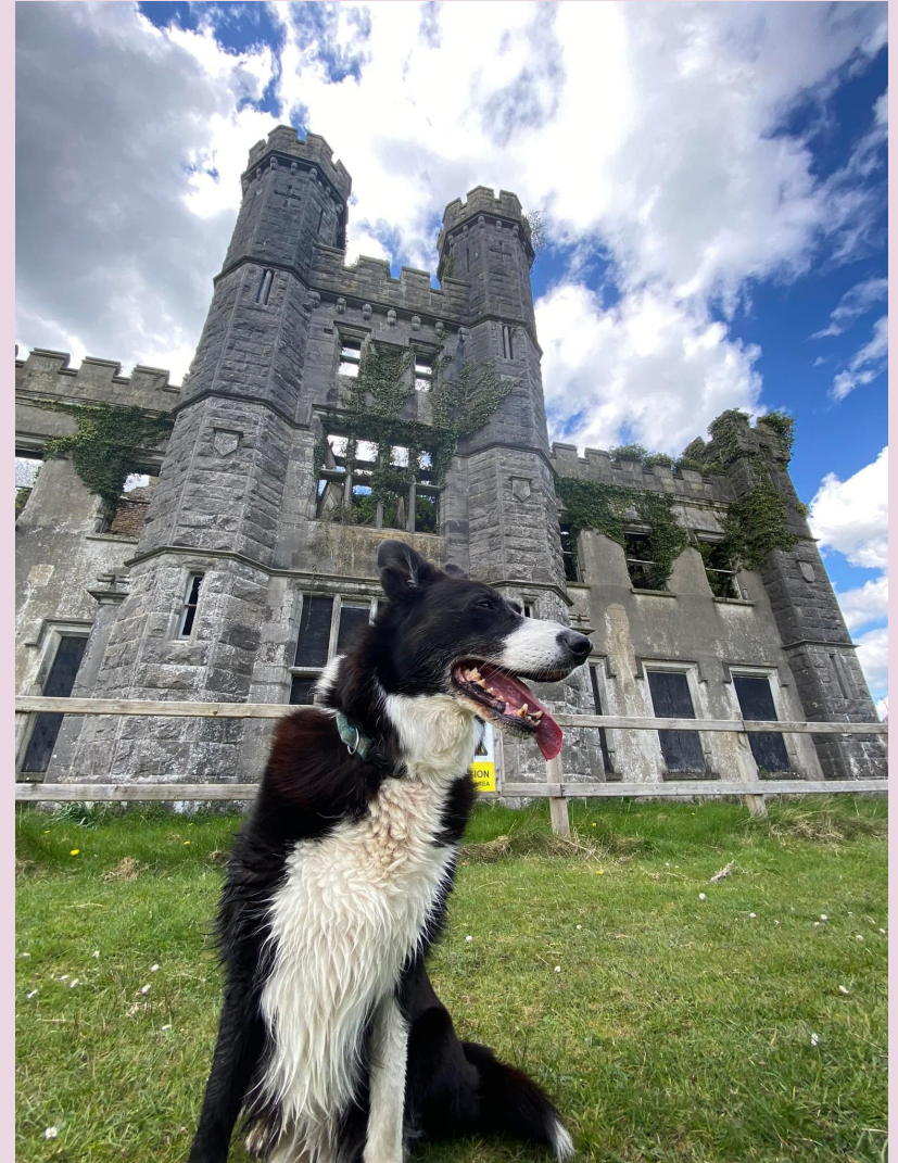
Picture: Castle Saunderson, Cavan/Fermanagh Border

Cavan PPN's work is solidly anchored into the themes of Representation, Networking and Capacity Building and in order to achieve this our values underpin these through Participation, Sustainability, Diversity, Inclusion, Empowerment, Respect, Accountability and Partnership.