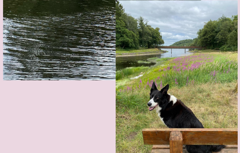
Picture: Killykeen Forest Park, County Cavan