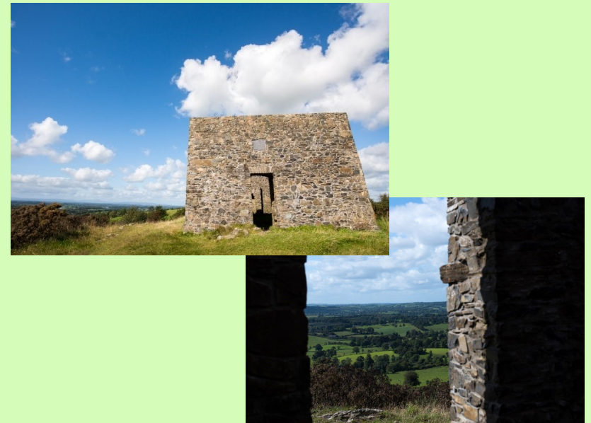
Picture: Flemmings Folly outside Ballinagh, Co. Cavan.

OBJECTIVE 3.3: Utilize roadshows to reach out to unknown groups to coax them into membership through training opportunities.